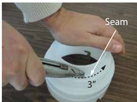
3" incision along seam

For a 4" pipe see step 6. For the 5" or 6" pipe, make a 3" incision along the appropriate seam. Tear the smaller size away for the adaptor and discard.