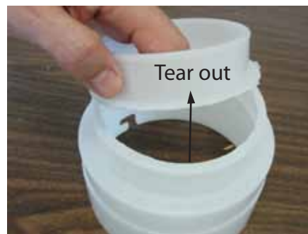
Tearing smaller size out