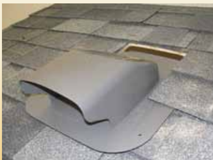
Sliding under shingles