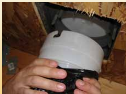
Insert adaptor into vent