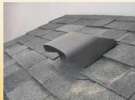
Vent in place