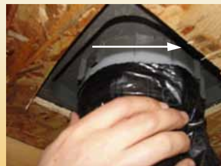
Turn adaptor to lock into place