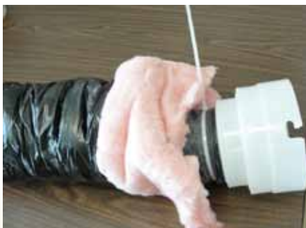
Duct strap installed over pipe

Secure the pipe to the adaptor with the duct strap provided. Tape or screws optional.